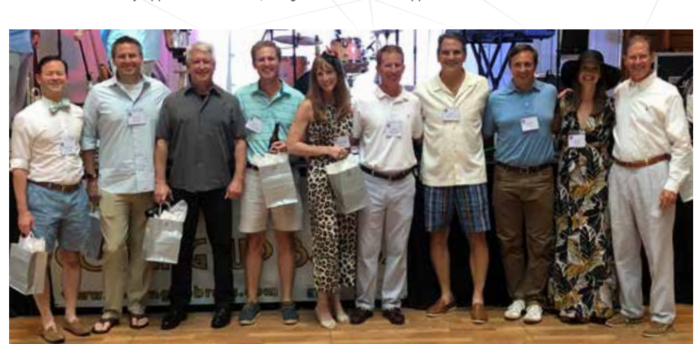
2019 Hinman Annual Meeting Chairs